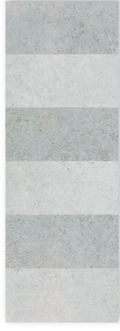
DOVER LINE ACERO 31,6x30x0,9cm P3470767 / 100155900 G271 Butech recomienda junta / Butech recommends joint: Colorstuk Rapid n Gris B22502013 / 100004306 ↑↑