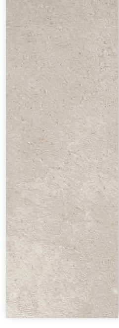
DOVER ARENA 31,6x30x0,9cm P3470756 / 100155613 G261 Butech recomienda junta / Butech recommends joint: Colorstuk Rapid n Gris B22502013 / 100004306 PERFIL DOVER ARENA 1,5x31,6cm P6209110 / 100156683 G77