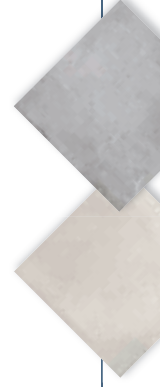
1 PAVIMENTO COMBINABLE: SERIE HARLEM 69,6x69,6cm • FLOOR TILES COMBINATIONS: HARLEM SERIE 69,6x69,6cm

*valores aproximados. *approximated values.