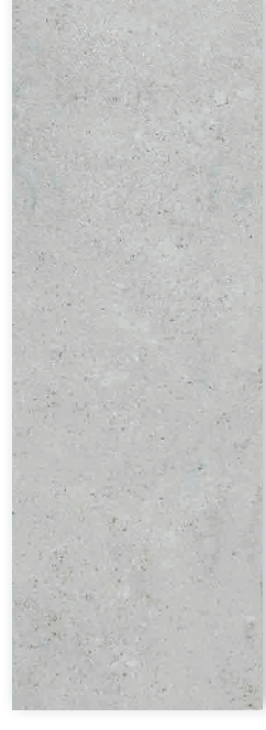
DOVER ACERO 31,6x30x0,9cm P3470759 / 100155567 G261 Butech recomienda junta / Butech recommends joint: Colorstuk Rapid n Gris B22502013 / 100004306 PERFIL DOVER ACERO 1,5x31,6cm P6209109 / 100156682 G77