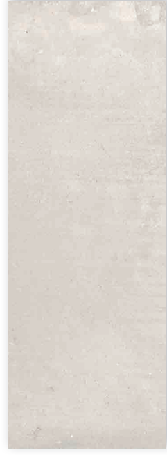
HARLEM CALIZA 31,6x30x0,9cm P3470783 / 100161061 G261 Butech recomienda junta / Butech recommends joint: Colorstuk Rapid n Gris B22502013 / 100004306 PERFIL HARLEM CALIZA 1,5x31,6cm P6209114 / 100161431 G77