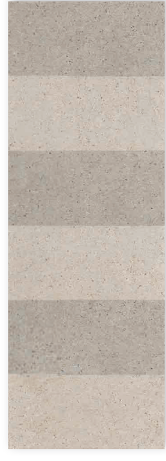
DOVER LINE ARENA 31,6x30x0,9cm P3470765 / 100155901 G271 Butech recomienda junta / Butech recommends joint: Colorstuk Rapid n Gris B22502013 / 100004306 ↑↑