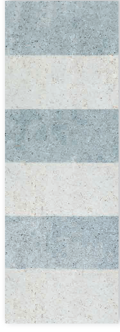
DOVER LINE CALIZA 31,6x30x0,9cm P3470766 / 100155902 G271 Butech recomienda junta / Butech recommends joint: Colorstuk Rapid n Gris B22502013 / 100004306 ↑↑