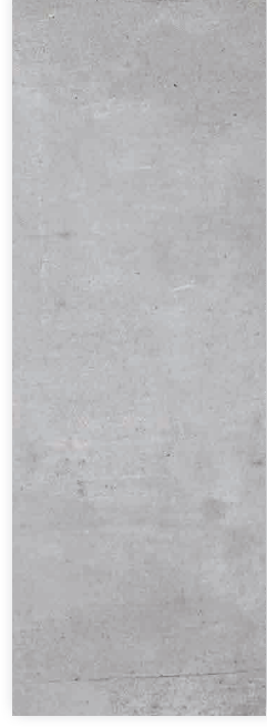
HARLEM ACERO 31,6x30x0,9cm P3470785 / 100161080 G261 Butech recomienda junta / Butech recommends joint: Colorstuk Rapid n Manhattan B22502002 / 100004295 PERFIL HARLEM ACERO 1,5x31,6cm P6209117 / 100161451 G77