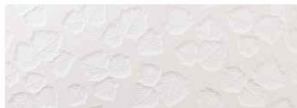
MANILA DECO BLANCO 31,6x90x0,92cm P3470806 / 100161477 G271 Butech recomienda junta / Butech recommends joint: Colorstuk Rapid n Blanco B22501001 / 100004294