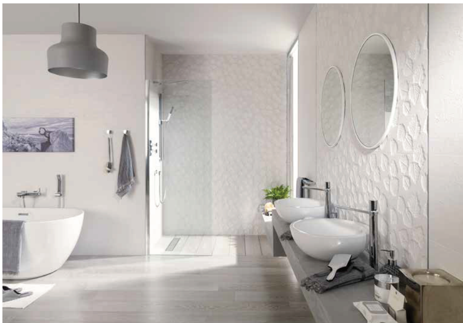
# MANILA BLANCO & MANILA DECO BLANCO 31,6x90cm

*valores aproximados. *approximated values.