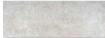
PARK ACERO 31,6x90x0,9cm P3470729 / 100145725 G261 Butech recomienda junta / Butech recommends joint: Colorstuk Rapid n Manhattan B22502002 / 100004295