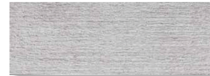
PARK LINEAL ACERO 31,6x90x0,95cm P3470726 / 100145729 G271 Butech recomienda junta / Butech recommends joint: Colorstuk Rapid n Manhattan B22502002 / 100004295