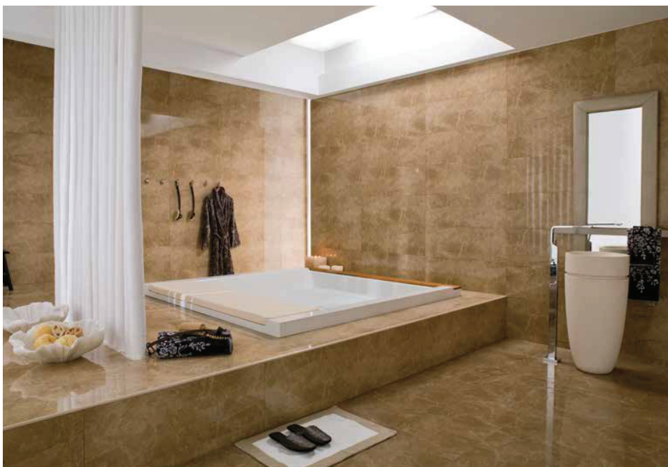
# KALI TABACO 31,6x90cm

PAVIMENTO COMBINABLE: SERIE KALI 43,5x43,5cm - PAG.206 FLOOR TILES COMBINATIONS: KALI SERIES 43,5x43,5cm - PAG.206