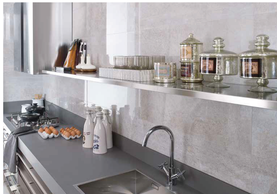
# GLASGOW SILVER 31,6x90cm

PAVIMENTO COMBINABLE: SERIE GLASGOW 43,5x65,9cm - PAG.160 FLOOR TILES COMBINATIONS: GLASGOW SERIES 43,5x65,9cm - PAG.160