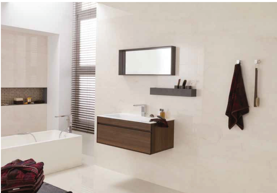
# OLIMPO MARFIL 31,6x90cm